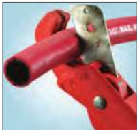
Cut hose end straightly in desired length.