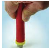
Insert hose into plastic yellow slot by pushing hose settled on fitting.

There is no need to insert clamp in this way. You need to cut hose end in order to remove hose from fitting.