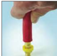
Insert hose into fitting.